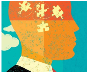
Why extroverts fail, introverts flounder and you probably succeed