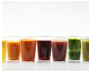
Notes from a newly converted juicer